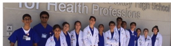
Clinical Rotation Students